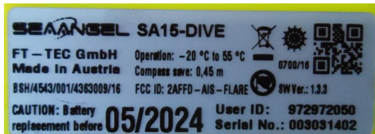
Figure 4: Battery expiration date

You will find the battery expiration date on the back of your SEAANGEL: