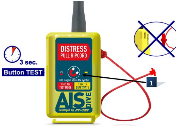
Figure 3: Deactivating the SEAANGEL