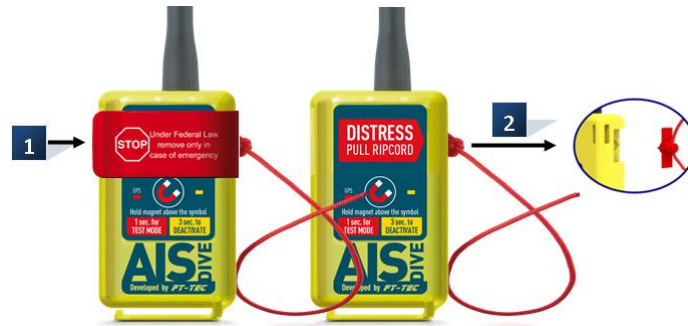
Figure 2: Activating the emergency alarm using the ripcord