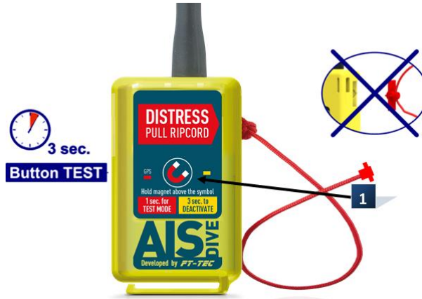
Figure 3: Deactivating the SEAANGEL