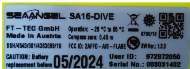
Figure 4: Battery expiration date

You will find the battery expiration date on the back of your SEAANGEL: